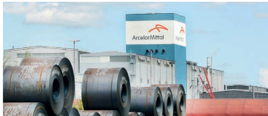
A steel production site with a long tradition: Founded at the start of 1950s on the German/Polish border as Eisenhüttenkombinat Ost, an iron ore factory with six blast furnaces, the steel works in Eisenhüttenstadt belongs today to the world's largest steel manufacturer ArcelorMittal and comprises a modern integrated iron and steel works campus incorporating state-of-the-art systems and technologies.

ArcelorMittal is planning to invest around 34 million euros in its steelworks in Eisenhüttenstadt this year. The money will be invested into, among others, increasing the capacity of the carbon dust injection plant for the blast furnace 5A and into preparatory maintenance, which is necessary prior to the scheduled comprehensive overhaul of the blast furnace next year. To compensate for the resultant downtime, blast furnace 1 has been blown in again for preproduction of steel slab during the forthcoming maintenance work. Over and above this, investments will be made in the installation of a