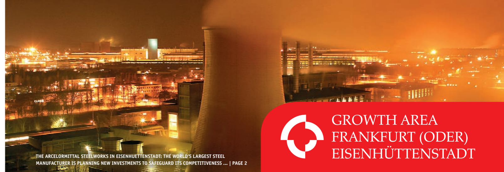
THE ARCELORMITTAL STEELWORKS IN EISENHÜTTENSTADT: THE WORLD'S LARGEST STEEL MANUFACTURER IS PLANNING NEW INVESTMENTS TO SAFEGUARD ITS COMPETITIVENESS ... | PAGE 2