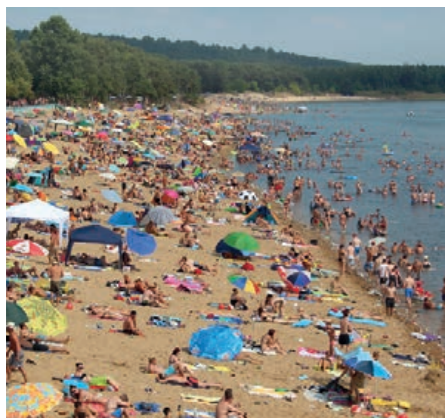
Located on the outskirts of Frankfurt (Oder): The Heleneesee covers an area of around 250 hectares. Including the guests at the legendary "Helene-Beach-Festival" during the summer, the operators of the park are expecting around 150,000 visitors this year.

The Heleneesee leisure and camping park, which is located just 3km from the Oder-Neiße cycling route, plans to strongly focus on cycling and nature tourists in the future. The Heleneesee is considered as one of the cleanest and most popular swimming lakes in the State of Brandenburg. The leisure park, which incorporates a long and sandy beach, several restaurants and various options for overnight stays such as a campsite, holiday bungalows and hostels, is ideal as a stopover location for young and old. The facility has also been listed by the German ADFC cycling club as a cyclist-friendly host in the category "bed+bike".