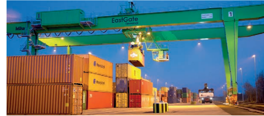
A gigantic, high-performance system: The new gantry crane at the terminal for intermodal transport in Frankfurt (Oder) enables significantly faster container handling. The crane runway, which was built and installed by the Austrian intermodal crane specialist KUNZ AG, can move up to 41 tons across all tracks above the 640 metre long handling site.

More than 10 million euros have been jointly invested by the city of Frankfurt (Oder), the State of Brandenburg, the German Federal Republic, the EU and the terminals operator PCC Intermodal (PCCI) for the expansion of the intermodal transport terminal in Frankfurt (Oder). One year ago, six to seven trains per week were being handled here. Currently, more than 22 trains with desti-