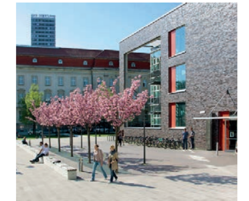
It's springtime on the Viadrina campus: With around 6,500 students from more than 80 countries, the European University Viadrina in Frankfurt (Oder) is one of Germany's most international universities.

The Centre for Entrepreneurship at the European University Viadrina in Frankfurt (Oder) will be focussing stronger on research into entrepreneurship and start-up businesses. It will henceforth be known as the Centre for Entrepreneurship & Research (CfER). The institution was founded to promote entrepreneurial spirit among students, alumni and academics. A new series of lectures is planned to establish this subject area more firmly in the Viadrina's teaching programme. Collaborations with companies in the Oder region and in southern Germany are also to be further developed. www.europa-uni.de