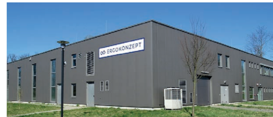
The company logo has already been installed: In opting for the location, ERGOKONZEPT AG cited particularly the site's excellent location near the motorway A12 and the existing environment in the Technology Park East Brandenburg in Frankfurt (Oder). The ultra-modern building was built in 2008 and is suitable for research and development as well as for series production. It has a floor space of 2,250 square meters and contains in addition to the production area also capacities for offices and research laboratories.

The ERGOKONZEPT AG has acquired the production hall of the former solar company Odersun in Frankfurt (Oder). The innovative company from Potsdam schedules to create around 60 new jobs in the fields of pharmaceuticals and motor development at its new location in the Technology Park East Brandenburg until the end of 2018. The former will include, among others, the development of homeopathic medicine and the production of stem cells for paramedicine. In addition, the company will concentrate on developing a technical solution enabling significant reductions in fuel consumption and harmful emissions from combustion engines.