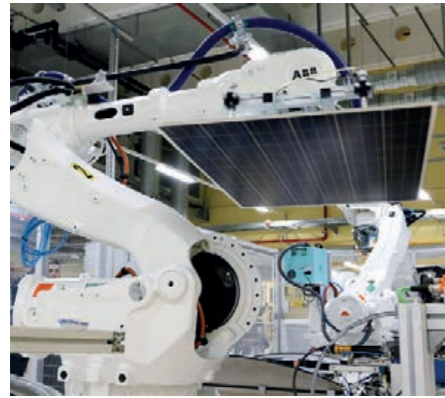
Astronergy currently produces around 750,000 crystalline solar modules per year in Frankfurt (Oder) using the latest robot technology and 210 staff. This corresponds to a total power of 180 MW.